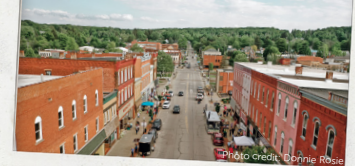
Route 6 Heritage Corridor, Corry, PA

Lawrence Park is an "industrial village" developed by General Electric, beginning in 1911. It was designed by acclaimed planner John Nolen, whose plan was built out from 1916 to 1965. In 2018, it was listed on the National Register of Historic Places. The Society maintains a collection of local artifacts, house histories, photographs, blueprints, memoirs, school yearbooks, and scrapbooks from the community.